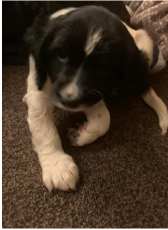
Nellie is an eight-week-old Springer Spaniel.